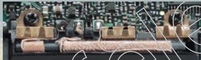
Internal ferrite bar antenna

1 Switchable with external antenna. 2 Increment figures are approximate.