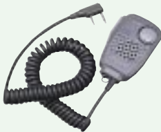
SMC-34 Speaker Microphone with Volume & Remote Control