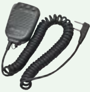
SMC-34 Speaker Microphone with Volume & Remote Control