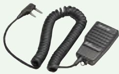
SMC-33 Speaker Microphone with Remote Control