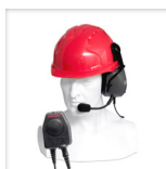
CHP750HS ■ CHP950HS ▲ Hard hat eardefender, submersible PTT

○ Submersible products are represented with a water droplet.