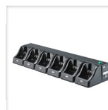
CSBHT ■ Six-way charger

Supplied package includes: 2000mAh Li-Ion battery pack, charger, spring loaded belt clip, high efficiency antenna & quick start user guide (ATEX models are supplied with an 1800mAh 7.4v Li-Ion Battery)